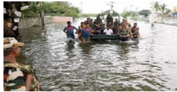
Assisi Aid Project: